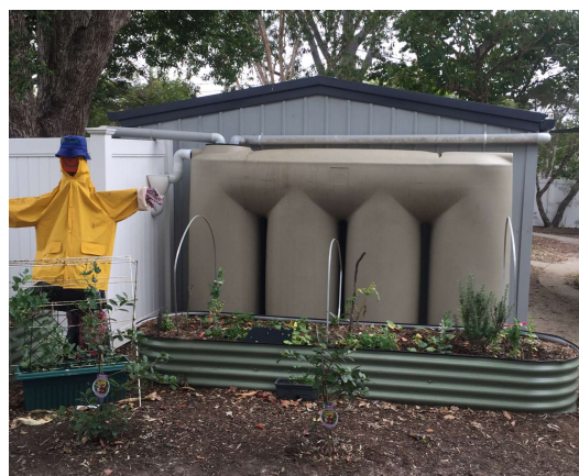
Mr Scarecrow is loving the garden area now!