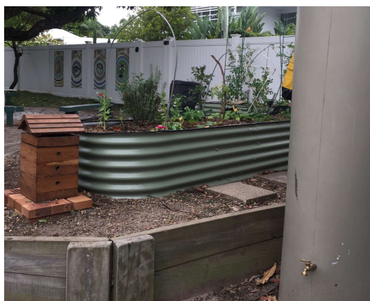
Thank you EB Solutions and Tyley family for connecting our water tank.